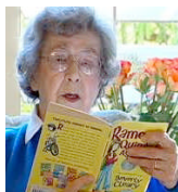
Beverly Bunn Cleary