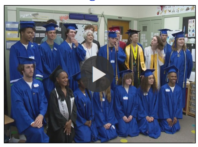
Click here to watch this touching story.