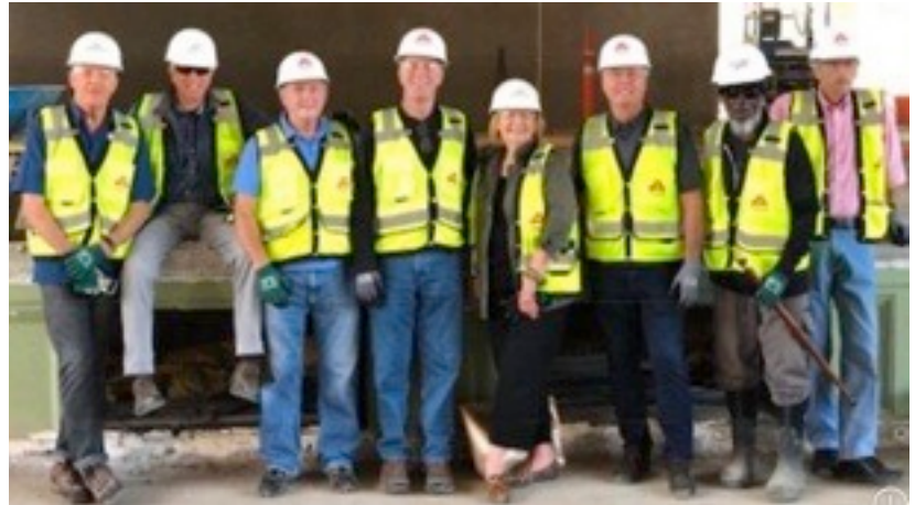
Reminiscing in auditorium