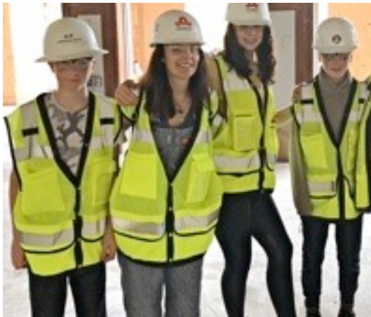
Current and future alums

Aren't you eager to see what is happening at Grant? The Alumni Assn. is providing you an opportunity to go on a tour of the remodel site! Tours are generally held the last Thursday of the month at 3:00 pm for a $20.00 donation to the mural restoration fund and can be scheduled by contacting grantalumni@aol.com . Tours are led by guides from the construction team and last 60-90 minutes. Everyone who has been on a tour has been in awe of the progress and of the future of Grant. Several tours already have a waiting list so schedule yours now! The project is on budget and on schedule for the September 2019 opening. The alumni assn. is indebted to the entire remodel team for their support.